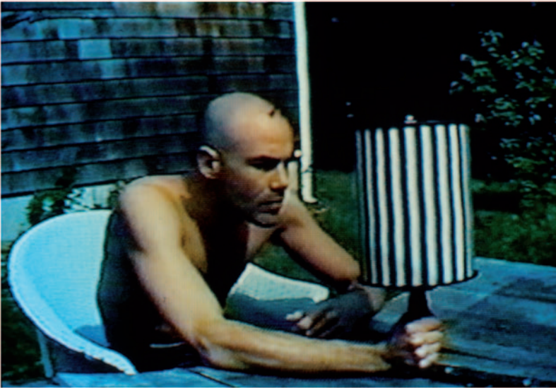
Figure 1 Brainwash , 1997 (single channel video, 00:04:30 mins) © Warren Neidich

the eyes tracks the eye movement of the subject. This sequence, revealing the subtle vibration of the eyeballs, is followed by a cut away shot of the eyes of the man at a distance which now move rhythmically to and fro, left and right. In the next scene the viewer visualizes a 180 degree pan of the horizon which is made to shake and tilt.