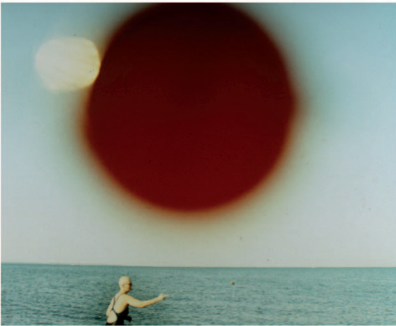
Figure 2 Double Vision, Louse Point, 1997–2000 (Type-C print, 16" × 20") © Warren Neidich