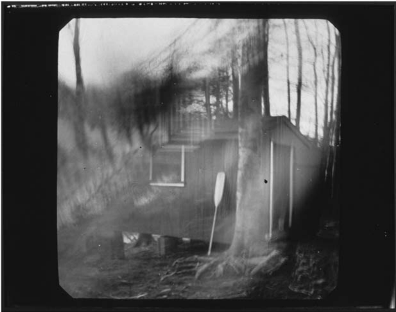
Figure 7 Law of Loci , 1998–99 (B&W print of Polaroid, 11" × 14") © Warren Neidich

the movement has indeed been performed, while in the image the posture is frozen. (De Duve, 1978: 114)