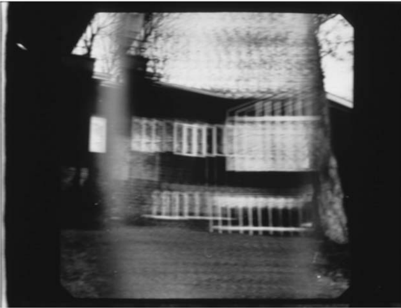
Figure 10 Law of Loci , 1998–99 (B&W print of Polaroid, 11" × 14") © Warren Neidich

no prior set of determinant codes governing the categories of memory, only the previous population structure of the network, the state of the value systems, and the physical acts carried out at a given moment. (Edelmann and Tononi, 2000: 97–9)