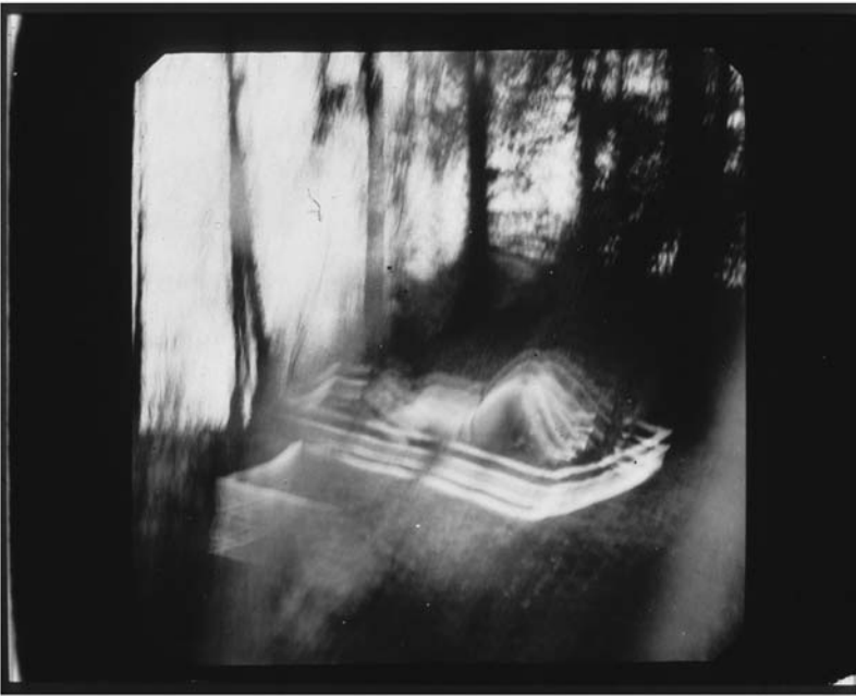
Figure 8 Law of Loci , 1998–99 (B&W print of Polaroid, 11" × 14") © Warren Neidich