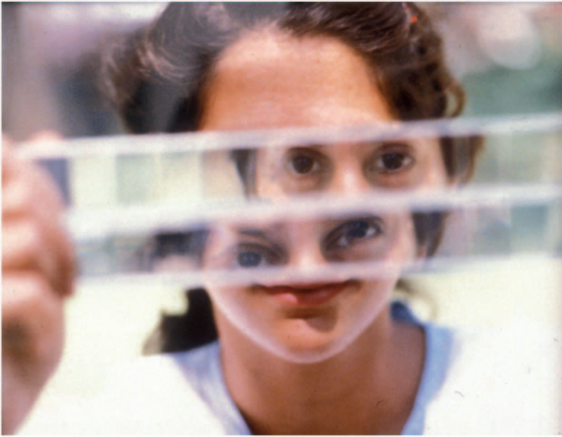
Figure 5 Shot Reverse Shot , 2001 (Type-C print and single channel video) © Warren Neidich

With the direct deployment of the prism bar in the Shot Reverse Shot project, one can observe that, in its playful use, it instigates the dissolution of personal space and boundaries that determine personal interactions. Though vision is refracted, the more general process of seeing, not only more, but above all unconventionally, is very much related to Neidich's neuro-biopolitical interests. Whereas Shot Reverse Shot can be seen as part of Neidich's interactive projects, the last photographic series being discussed in this paper is dedicated to photography as a medium of guarding the past (actually the present in its moment of capturing) for the future. It is also part of Neidich's extensive explorations into the 'history of consciousness.'