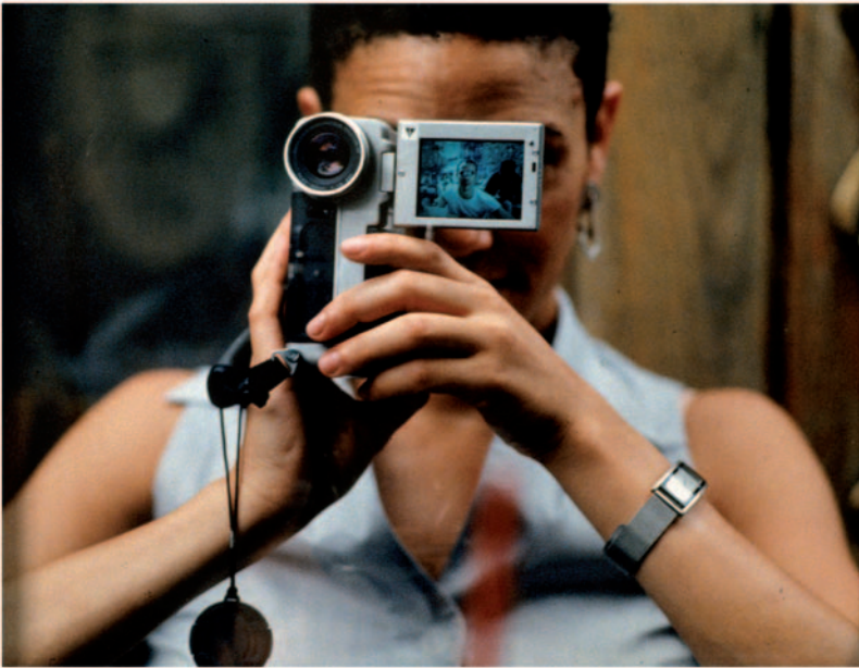
Figure 6 Shot Reverse Shot , 2001 (Type-C print and single channel video) © Warren Neidich

By moving through his parents' house and its environments, the artist explored and questioned one of the core functions of photography: capturing traces of actuality. As Roland Barthes showed poignantly in Camera Lucida (1981), the photograph occupies the place of remembrance and mourning. It remains striking that by capturing images of beloved persons and places, the present of that particular moment is inscribed into the surface of the filmic material the very moment it is taken and is turned into the past. Neidich's series of Law of Loci above all visualizes this paradoxical nature of photography.