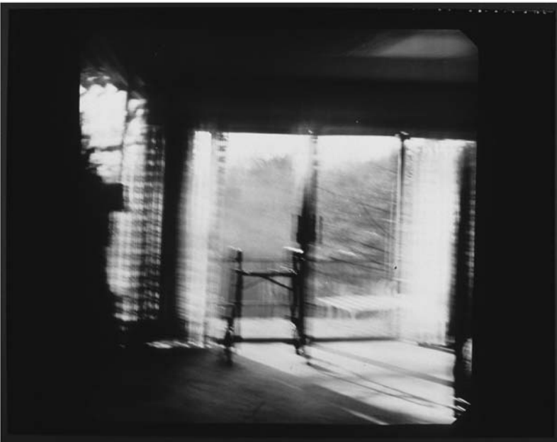
Figure 9 Law of Loci , 1998–99 (B&W print of Polaroid, 11" × 14") © Warren Neidich