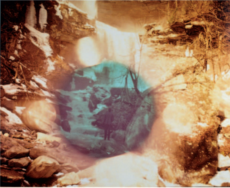
Figure 4 Double Vision, Katterskill Falls, 1997–2000 (Type-C print, 16"×20") © Warren Neidich

screen is the place of the subject who is not only 'caught, manipulated, captured, in the field of vision' (Lacan, 1981: 92 and Jay, 1998: 364) but who also embodies the paradox of being in between light and opacity simultaneously. Through the screen concept, the single focus of the God's eye-view is clearly abandoned.