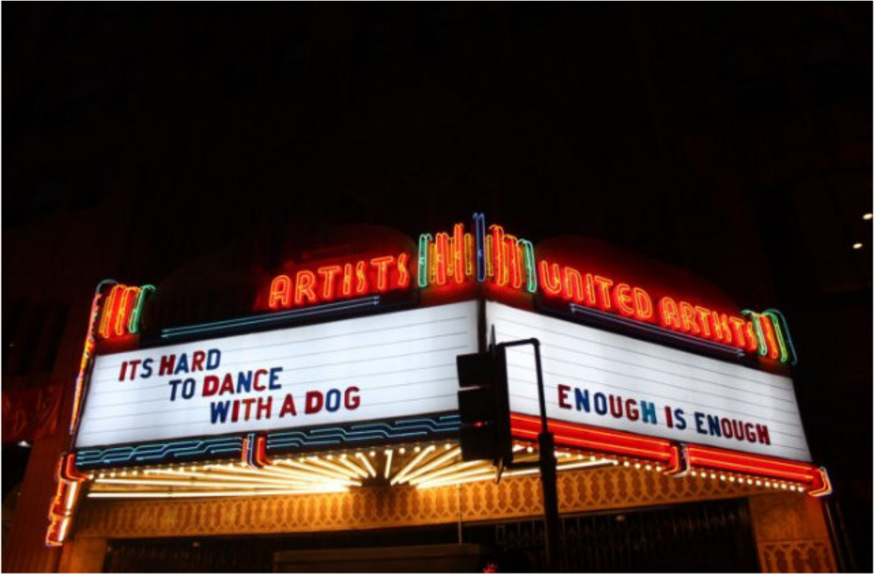
Lawrence Weiner, 2020