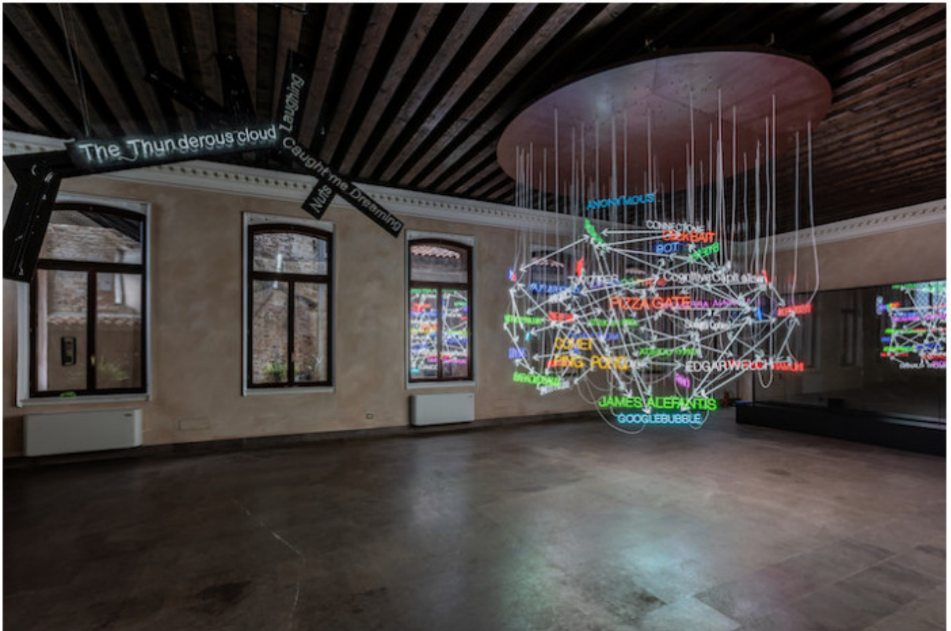
Pizzagate Neon, 2019, Neon Glass, Zucca Project Room, Venice Biennial.