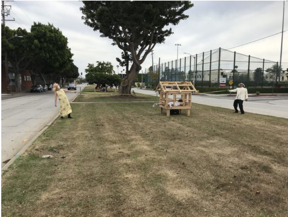
Drive-By-Art (Public Art In This Moment of Social Distancing) (2020). Installation view.