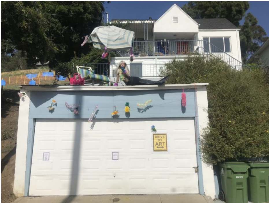
Drive-By-Art (Public Art In This Moment of Social Distancing) (2020). Installation view. Image courtesy by the organizers