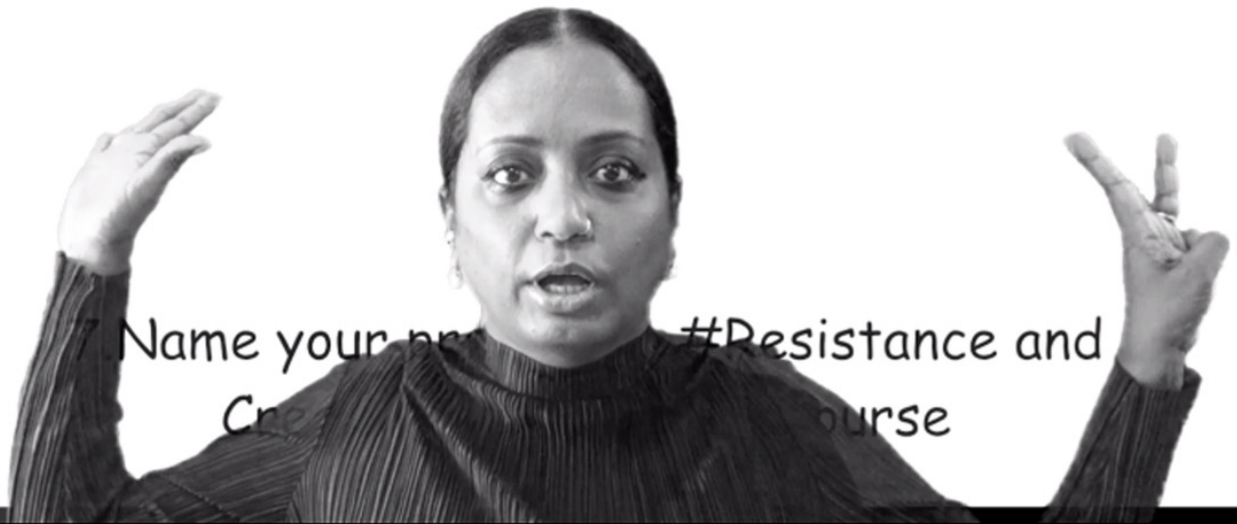
Mithu Sen, How to be A SUCKcessfull artist, 2019, video, 1'11", © Mithu Sen

6. Polish your #Yoga and Sexy native accent