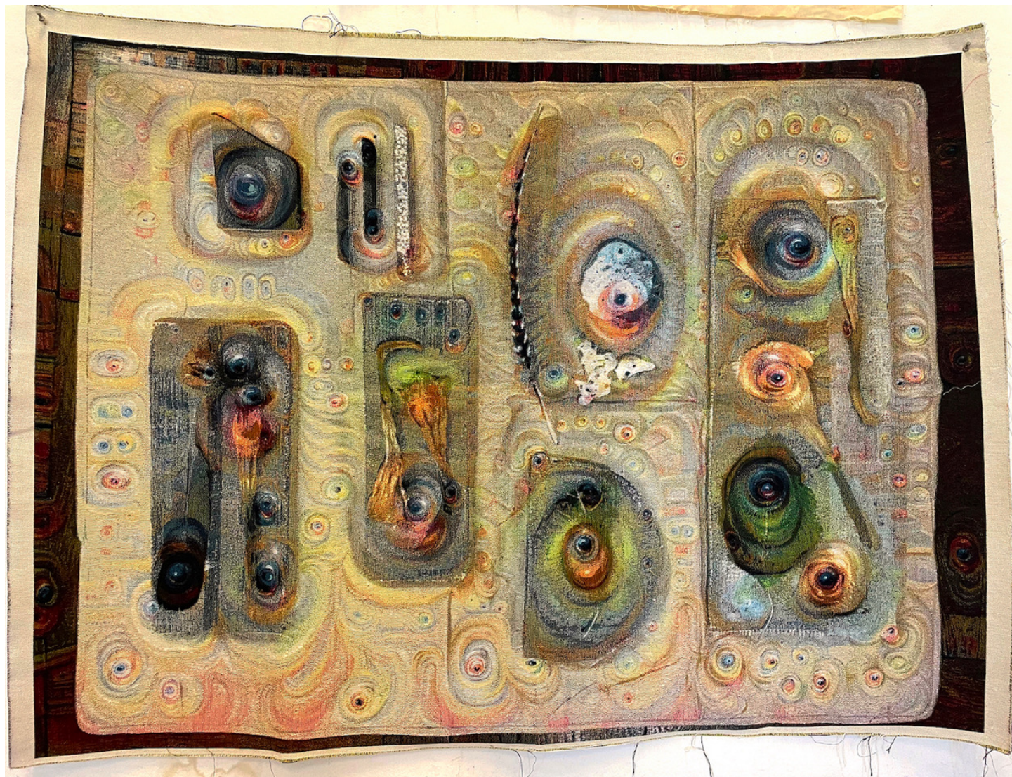
Elena Bajo, Buried in Your Petals (Datura Dreams), 2023, plant dye on woven cotton textile, jacquard loom, seeds, leaves, flowers, branches, roots, 119, 4 x 91,4 cm, © Elena Bajo, courtesy PRISKA PASQUER GALLERY

We don't want to live in a Universe, We want to live